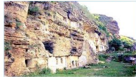
Tipova Village, an Orthodox cave monastery in Moldova.